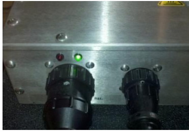
1- Failsafe Working, Normal operation

Temperature limits set in the controller are intended to prevent operation at temperatures above 175C. Therefore, under normal operation the red LED should never come on. Device under test self heating, system component failure or other possible issues could cause the red LED to come on. Should the red LED come on, turn the system off immediately. Before using the system again, make sure the temperature of the system is back in normal operating range (< 200 deg C), then turn power back on again. Under normal conditions, cycling power resets the bimetal failsafe thermostat latch circuit. If the green light comes on and the red is off, the safety switch has reset itself and normal operation may be reestablished. If the red light continues to come on, the system needs to cool down or is in need of service. Remove power and consult factory.