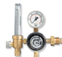
Dry Nitrogen Purge Regulator with Flowmeter