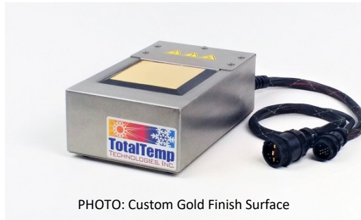
PHOTO: Custom Gold Finish Surface

THERMAL PLATFORM USED FOR PRECISION TEMPERATURE TEST