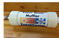
14-0010 Super Quiet Muffler (SQM)

Greatly reduces the noise level of coolant being spent by a Thermal Platform