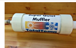
14-0010 Super Quiet Muffler (SQM)

Greatly reduces the noise level of coolant being spent by a Thermal Platform