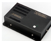
28-00101 Data logger

Sensors are available for extended temperature ranges or for Space Simulation Applications